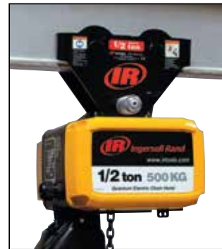
PT Series plain trolley with hook suspension