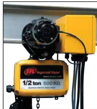
Motorized trolley suspension