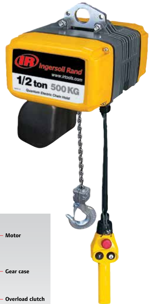
Electric Chain Hoists

Ergonomics — Safety-first pendent control handles are comfortable and fit securely in the operator's hand. Each low-voltage (42-volt) control handle integrates a large, red emergency stop button. Operating buttons are clearly marked with high contrast arrows, feature soft-push action, and are horizontally aligned for easier operation.