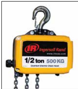
Eyebolt and hook suspension